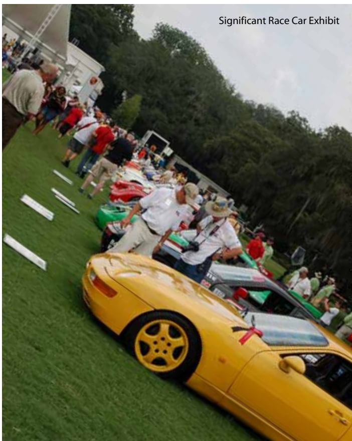
Significant Race Car Exhibit