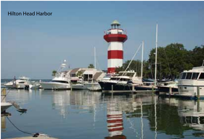
Hilton Head Harbor