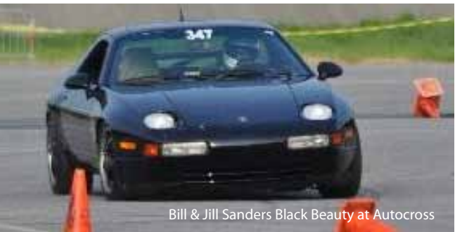
Bill & Jill Sanders Black Beauty at Autocross