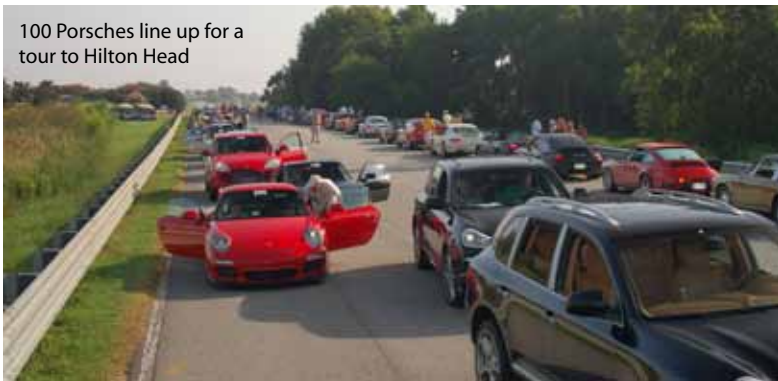
100 Porsches line up for a tour to Hilton Head