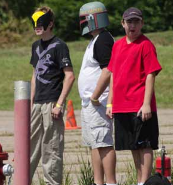
Our vigilant corner workers