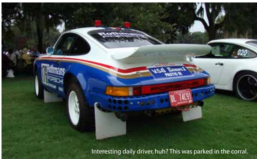
Interesting daily driver, huh? This was parked in the corral.