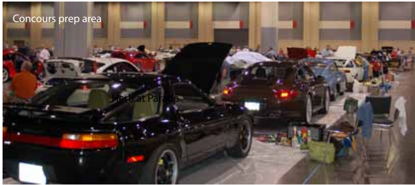
Concoors prep area