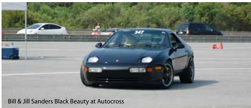
Bill & Jill Sanders Black Beauty at Autocross