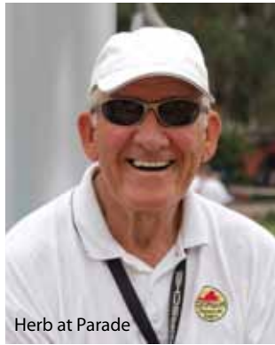
Herb at Parade