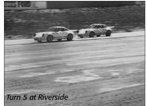
Turn 5 at Riverside

The second race saw George Follmer start in ninth and finish first, with Donahue out early due to mechanical failure.