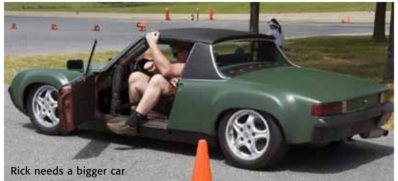
Rick needs a bigger car