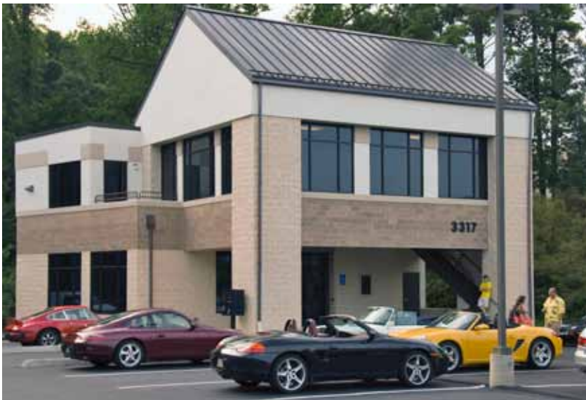
The PrintSource Building