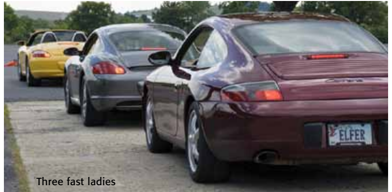
Three fast ladies