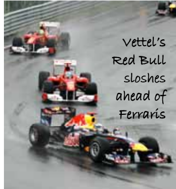
Vettel's Red Bull slashes ahead of Ferraris