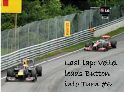
Last lap: Vettel leads Button into Turn #6