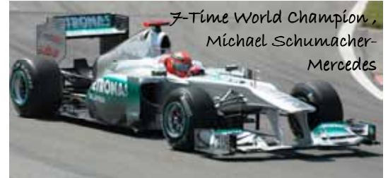
7-Time World Champion, Michael Schumacher- Mercedes