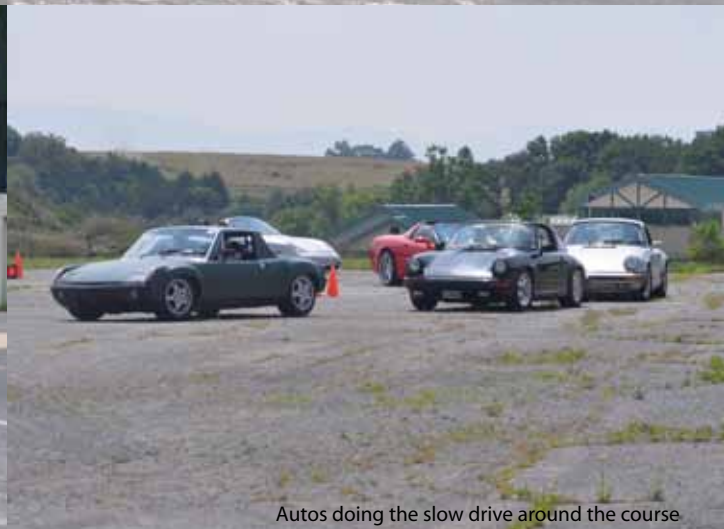
Autos doing the slow drive around the course