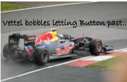
Vettel bobbles letting Button past..