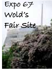
Expo 67 World's Fair Site