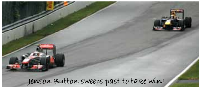
Jenson Button sweeps past to take win!