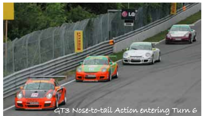
GT3 Nose-to-tail Action entering Turn 6