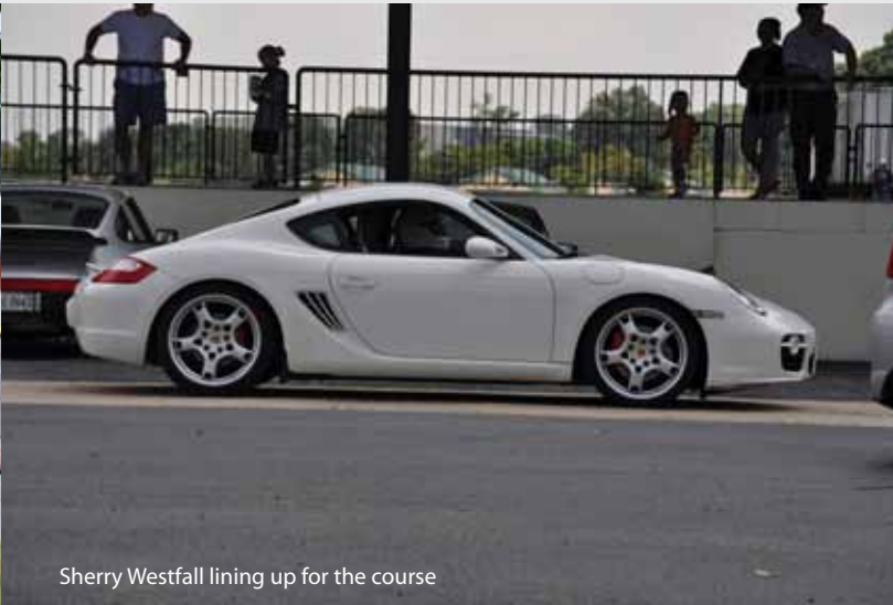
Sherry Westfall lining up for the course