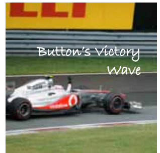
Button's Victory Wave