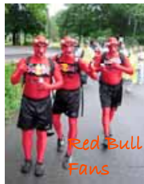
Red Bull Fans