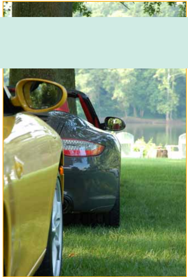
Side Views and the James River