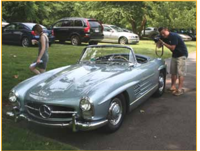
No Porsche, but not too shabby