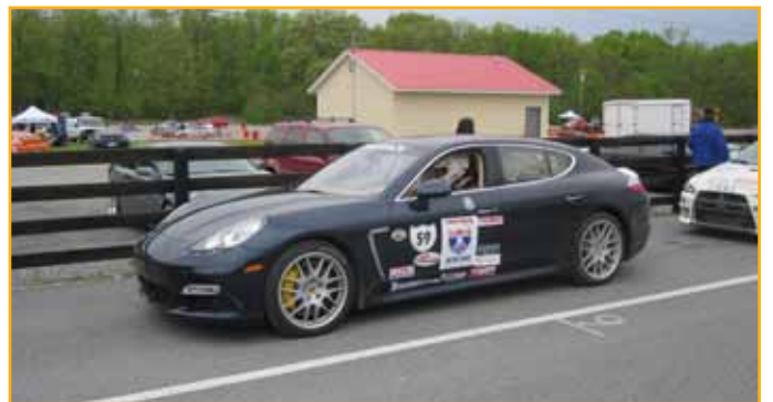
Panamera at 1 Lap