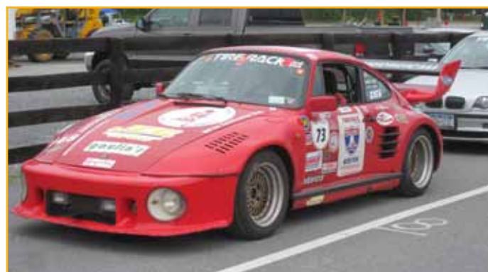
930 at 1 Lap