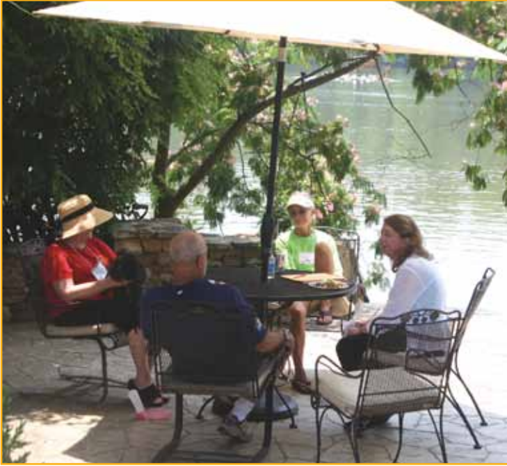
Presidential Lunch Brunch