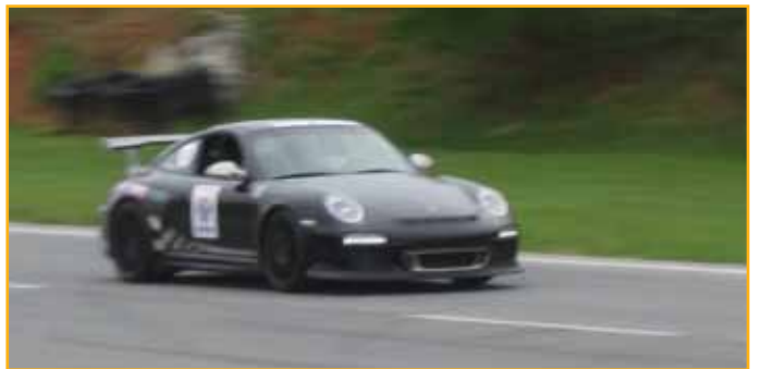
GT3RS on Track