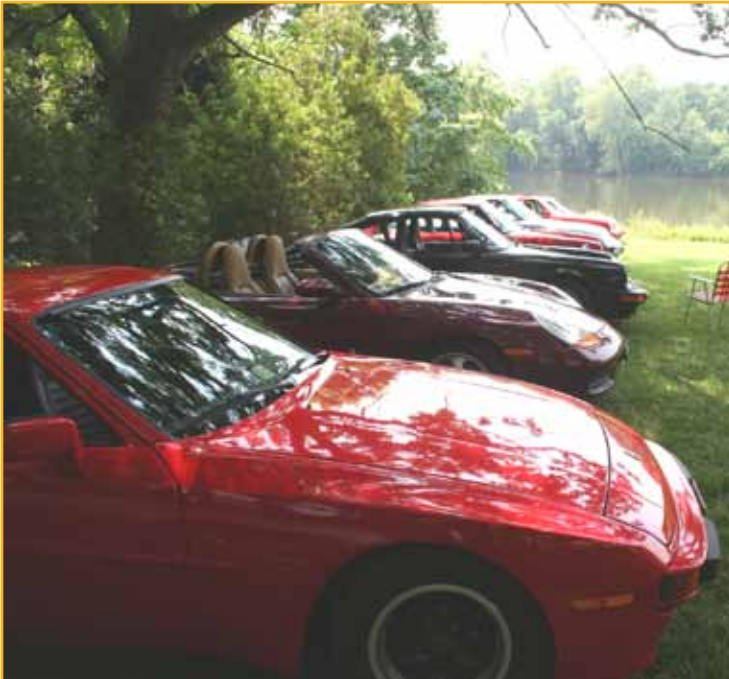
Proof I made it there