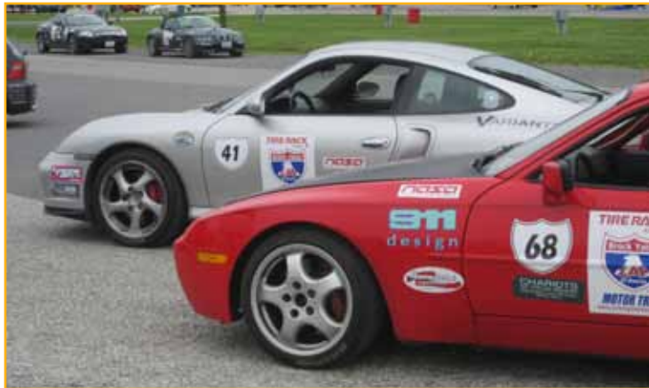
996TT and 944T

These are from Brock Yates' 1 Lap of America when they visited Summit Point on Sunday May 1st for a Time Trial. Each car is driven by a team of two drivers. Each driver got a timed 3 lap run and results were based on the cumulative time of all three laps. Then they packed their gear into the cars and headed off to Carolina Motorsports Park for the next event the following day.