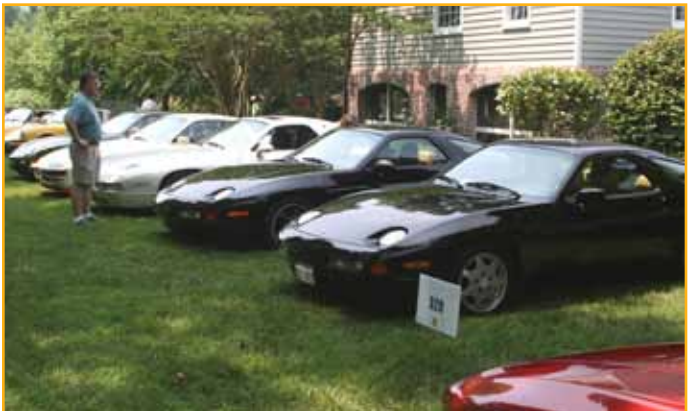
Front Engine Row