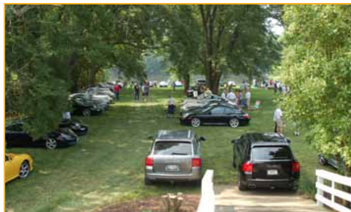
Overlooking the scene