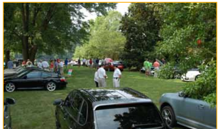
Porsches and People