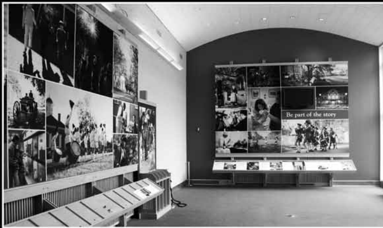
Colonial Williamsburg Multiple Fabric Mural Heavy Knit with FABEZE Frame Application

Bold. Dynamic. Vibrant. You have an idea and a space to fill. We have a variety of ways to bring it to life!