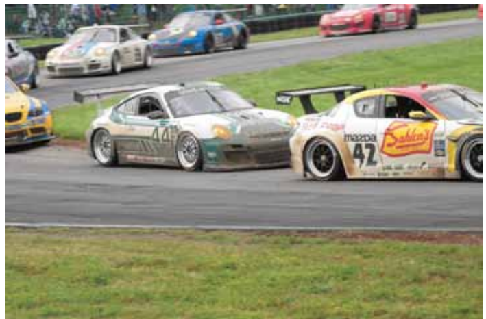
Porsche GT3s battle Mazdas & BMWs