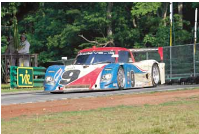
No. 9 Porsche-Riley at Oak Tree