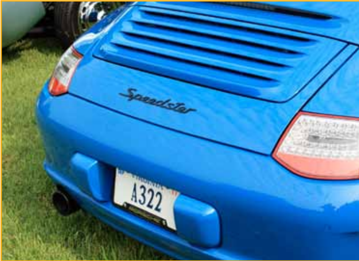
One of only 100 Speedsters imported into the U.S. from total production run of 356 cars