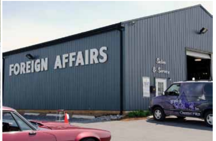
The Foreign Affairs shop near Staunton