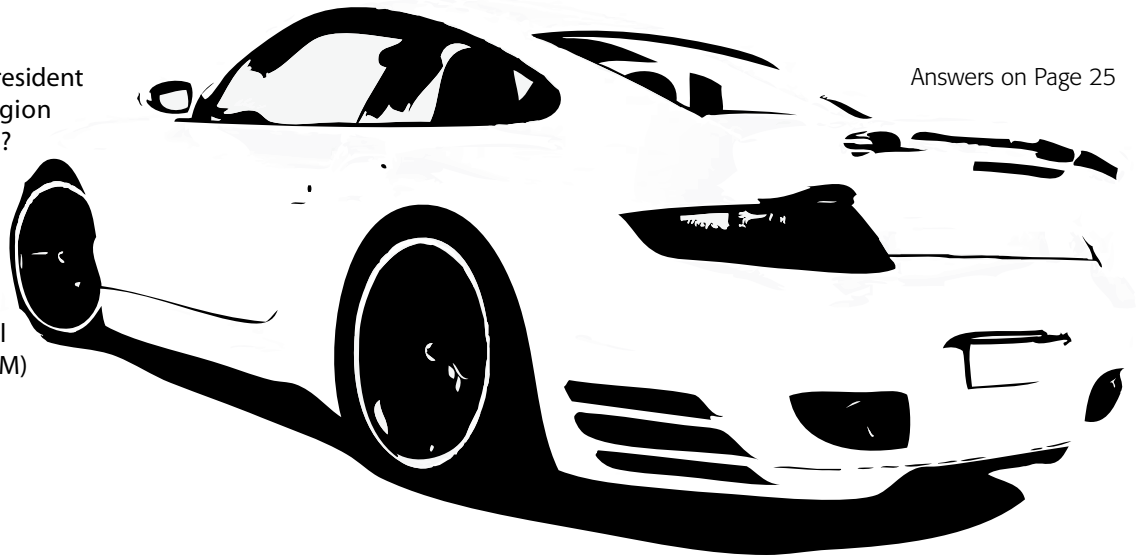
Answers on Page 25

Bonus Question: The Shenandoah Regional Newsletter underwent some changes in March 1999. What were the changes and who was the editor?