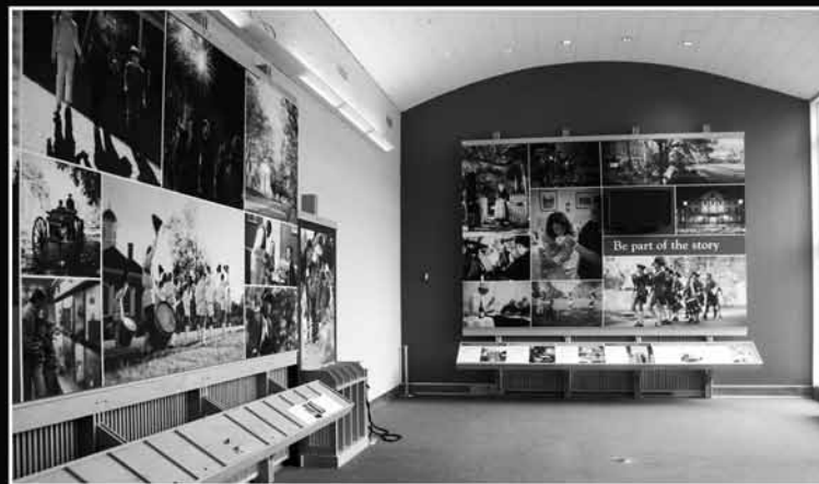
Colonial Williamsburg Multiple Fabric Mural Heavy Knit with FABEZE Frame Application

Bold. Dynamic. Vibrant. You have an idea and a space to fill. We have a variety of ways to bring it to life!