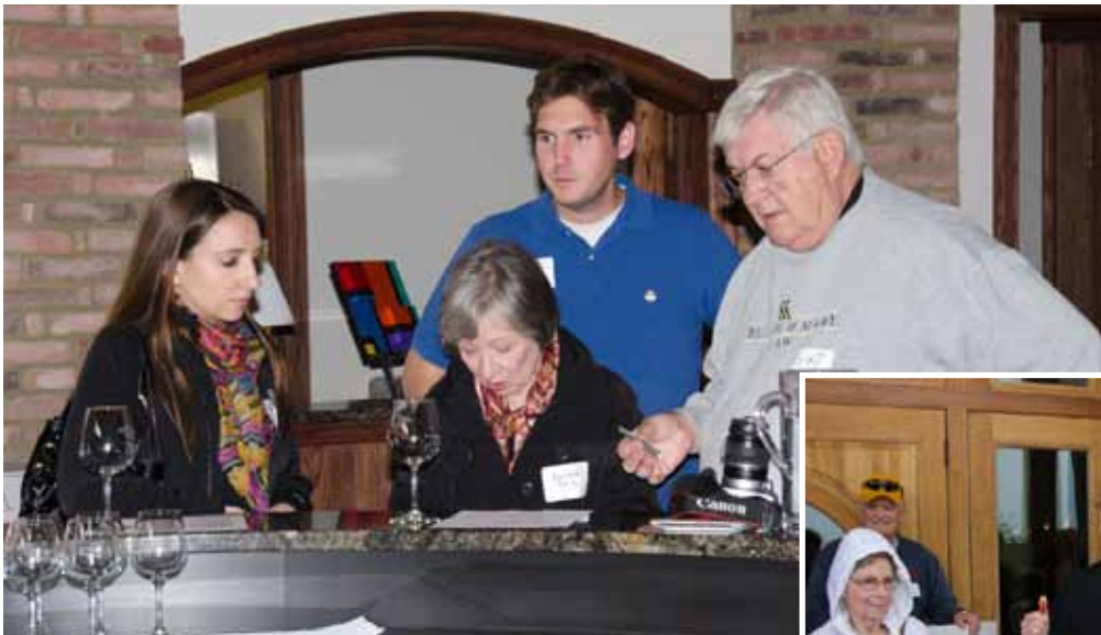
Wine tasting at the Sweely Estate Winery