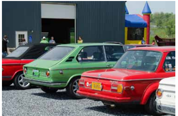
A rare hatchback BMW 2002 "Touring"