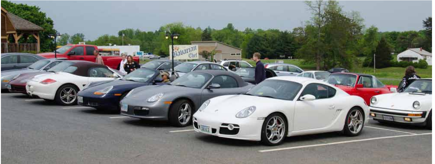
Arriving at the Bavarian Inn