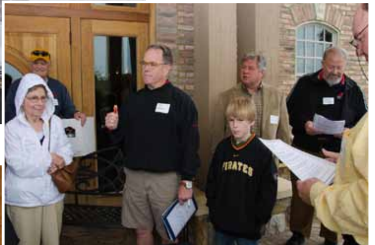
Members gathering at the door to the winery