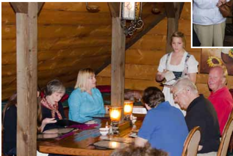
You never go away hungry from the Bavarian!