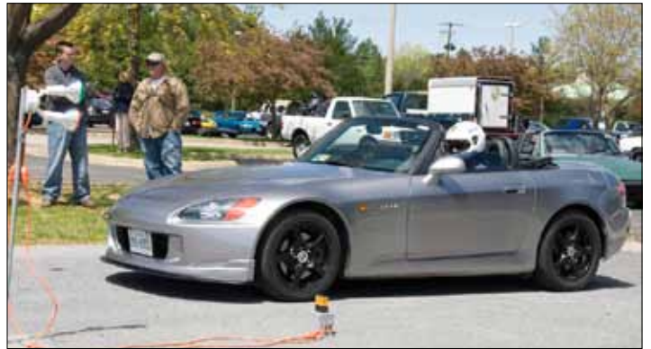
S2000 Waiting to Go