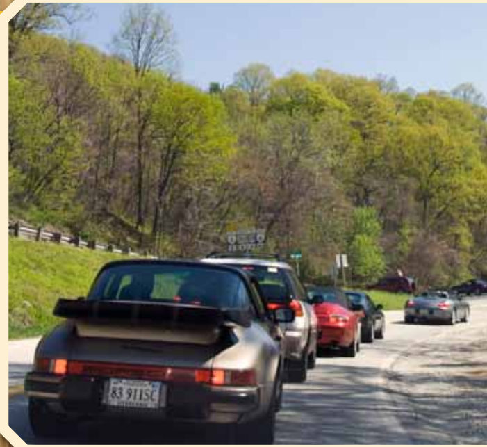
Colorful line of Porsches on the Blue Ridge Parkway

ARTICLE BY SHERRY WESTFALL ON PAGE 9