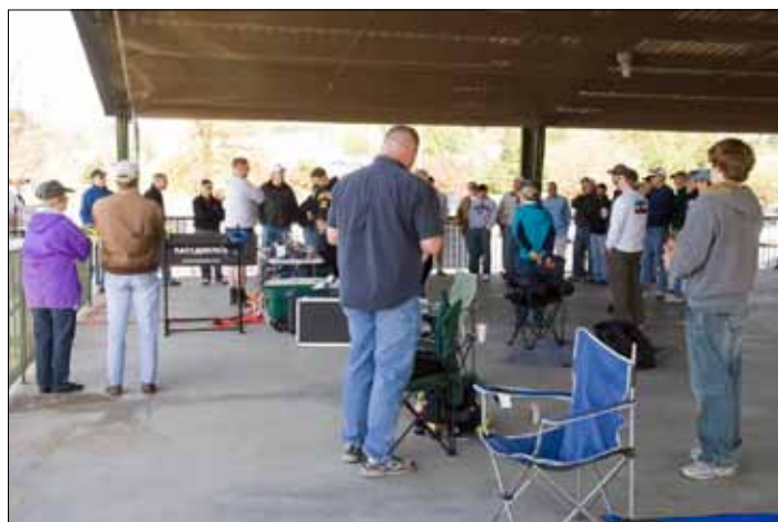
The Drivers Meeting