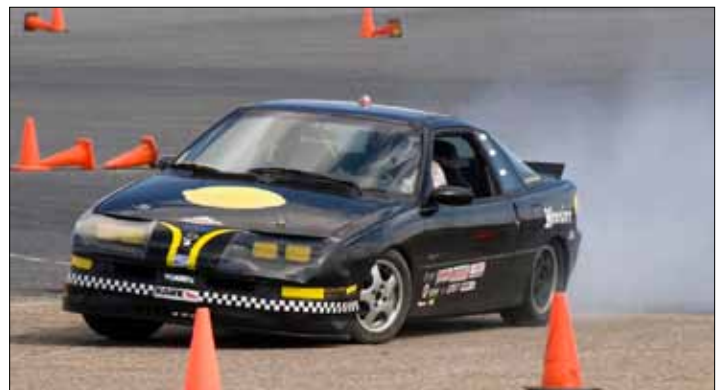
Howie Dunbrack's LeMons