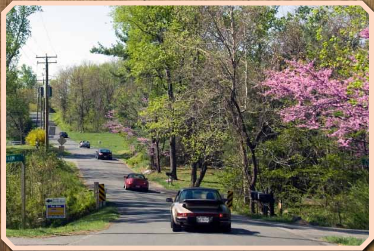
Beautiful Spring Day in Virginia