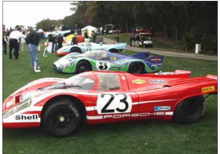
SIX 917S IN A ROW