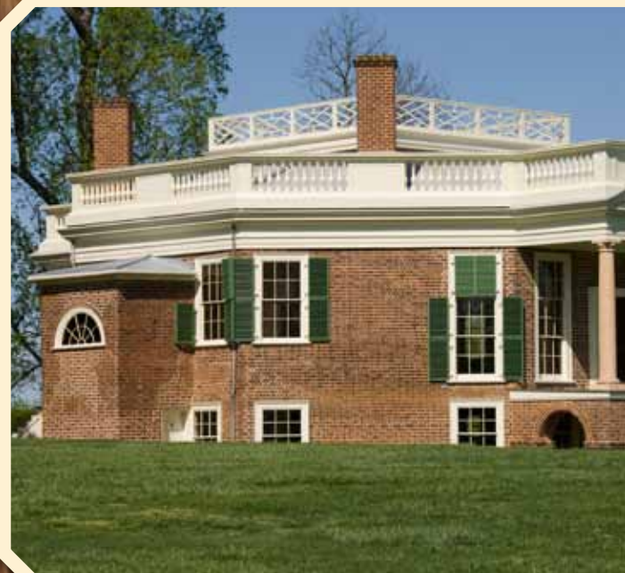
Jefferson's personal and private retreat, Poplar Forest