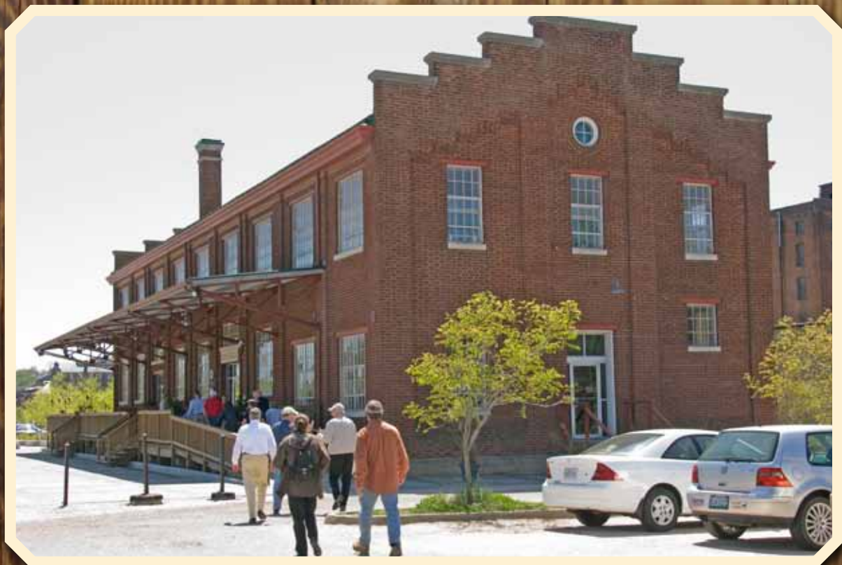
Lunch at the Depot Grille in Lynchburg