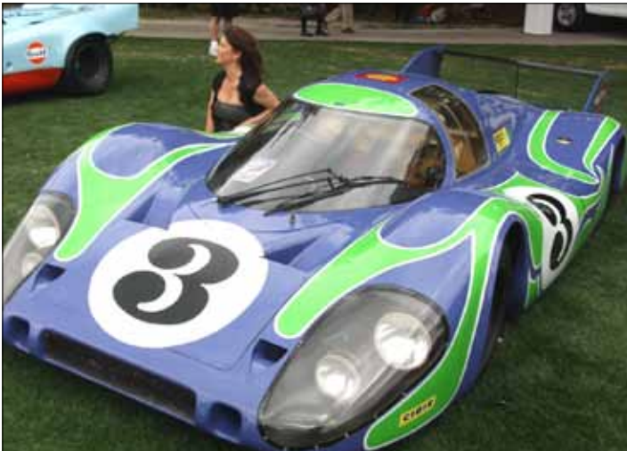
BEAUTY & THE BEAST