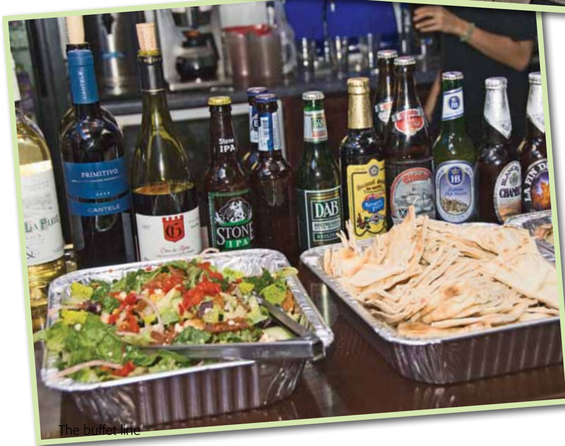
The buffet line