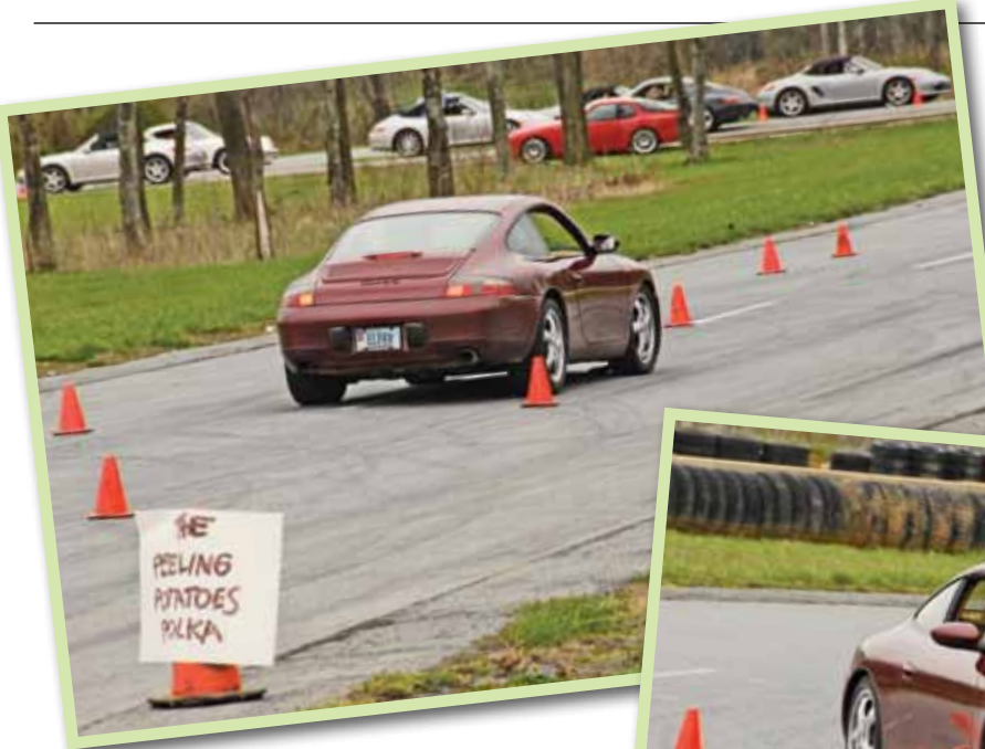
Peeling: The Peeling Potatoes Polka: Avoiding an obstacle while braking