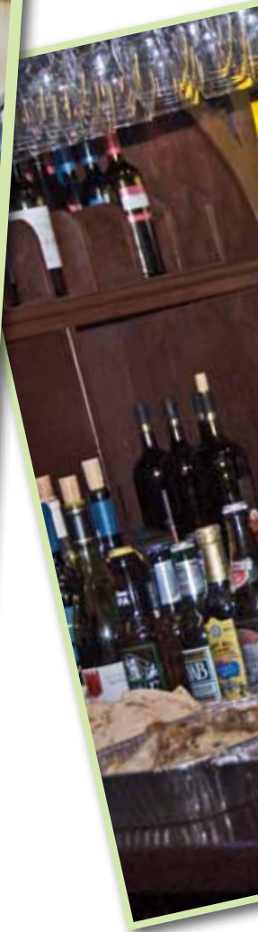
Our servers behind the buffet line