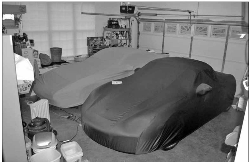
"BB" and "Ferdinand" are still waiting for spring