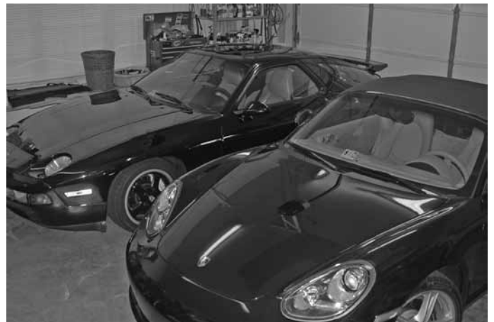
BB the 928 GTS and Ferdinand the '09 Boxster wait for Spring