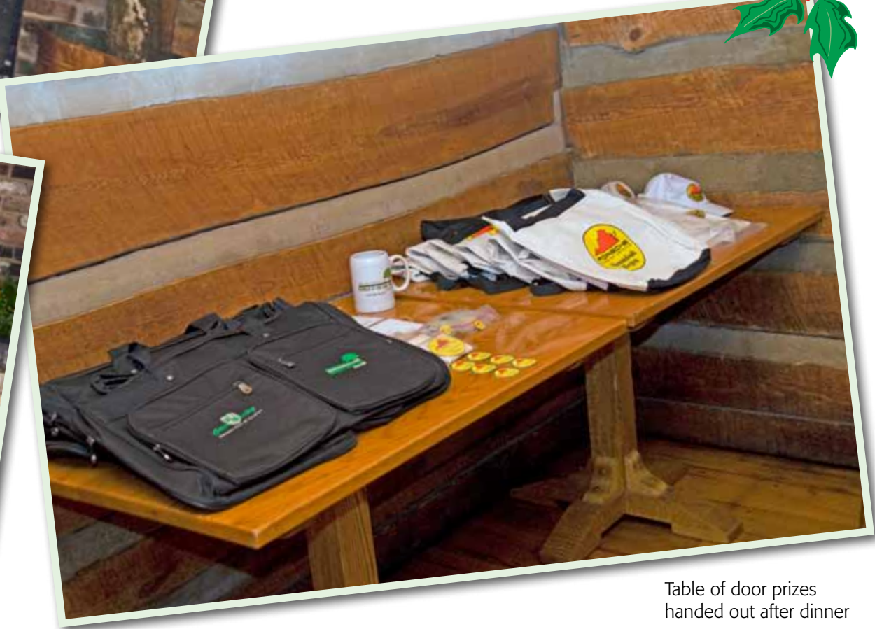
Table of door prizes handed out after dinner