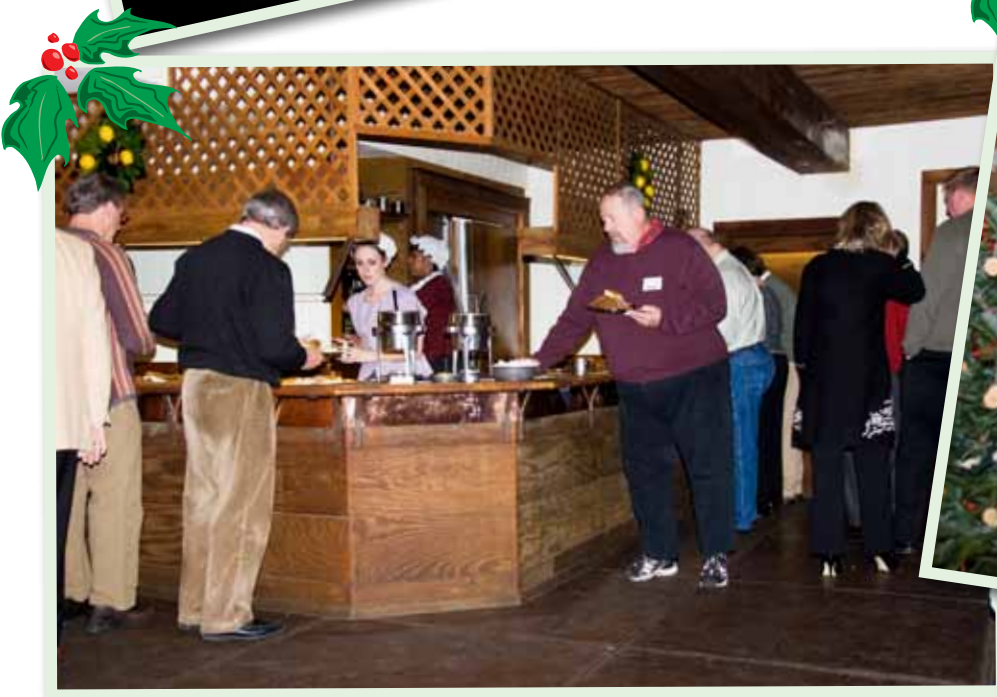
The buffet line