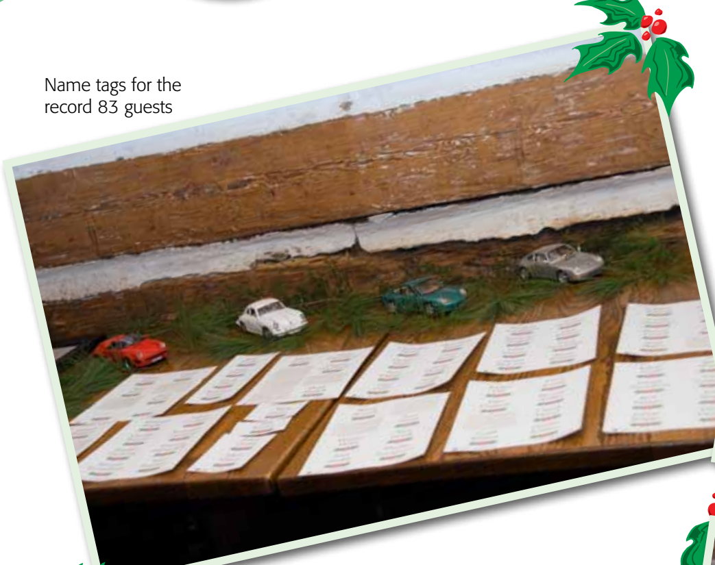
Name tags for the record 83 guests