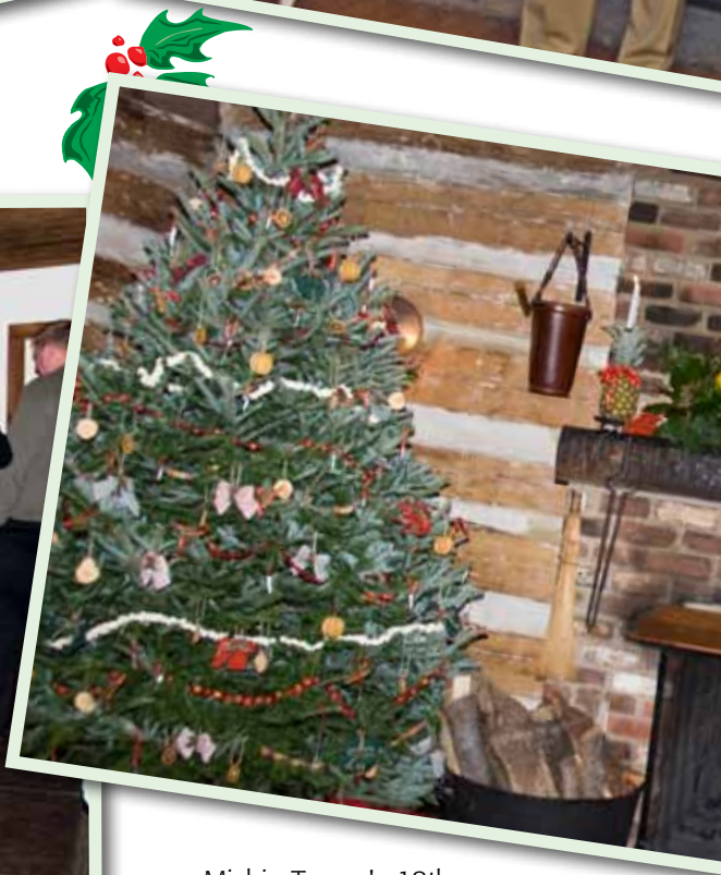
Michie Tavern's 18th century decorations